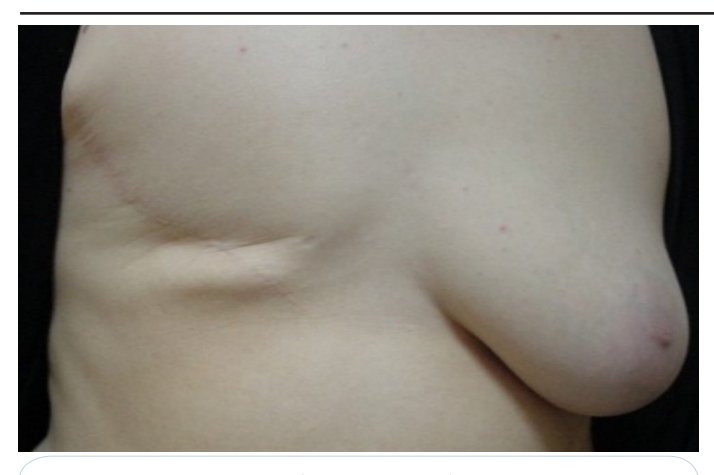
Figure 1: Mastectomy with its cosmetic shortcomings