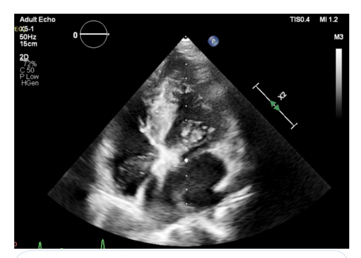
Figure 2: Apical 4-chamber view showing strand like mass in the right atrium.