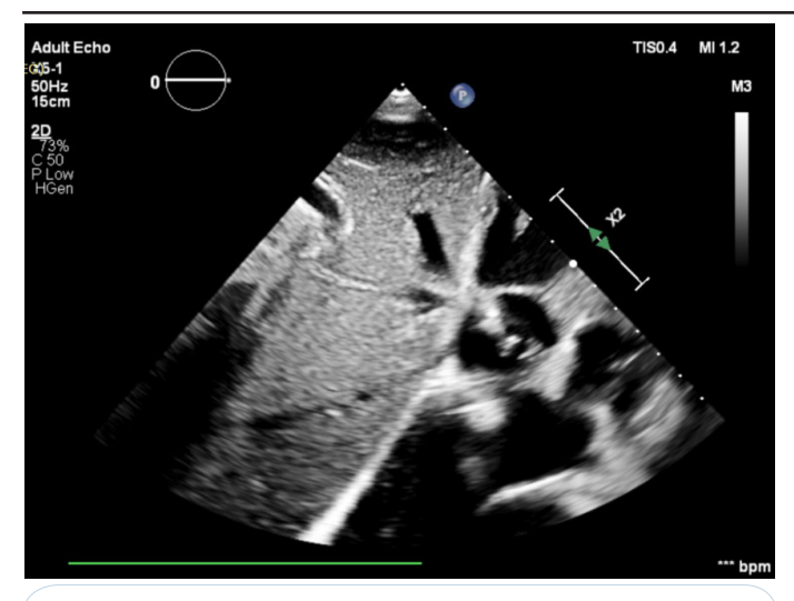
Figure 1: Sub costal view showing strand like structure in the right atrium.