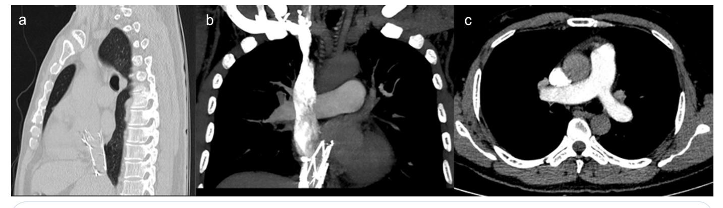
Figure 1: (a) Stent displaced into right atrium in median sagittal section.

The right atrial mass was removed under extracorporeal circulation but without clamping the aorta. After midline sternotomy, direct mean pulmonary artery pressure (mPAP) was measured approximately 70mmHg, bicaval and ascending aortic cannulation were accomplished, and total cardiopulmonary bypass was initiated. Right atriotomy was made, and an endovascular stent was suspended in the right atrium, originating from the orifice of the IVC, the FreeFlo proximal end configuration was oppressing the anterior and septal tricuspid valve which caused tricuspid valve insufficiency, another end configuration was rubbing the free wall of the right atrial near to septal tricuspid valve, bringing out a loose and actinian mass adhere to the wall (Figure 2). Histology examination revealed the mass was a thrombus. A natural function of tricuspid valve was detected after removing the stent exposed in the right atrium. Another mPAP still about 70mmHg was measured after terminating cardiopulmonary bypass. Macitentan has been taken in postoperative which maintained the pulmonary pressure about 50-70mmHg. Moreover, the duration of ventilation was about 28 hours, and the length of stay in Intensive Care Unit was about 3 days. The postoperative course was uneventful and repeat transthoracic echocardiography demonstrated no abnormal findings.