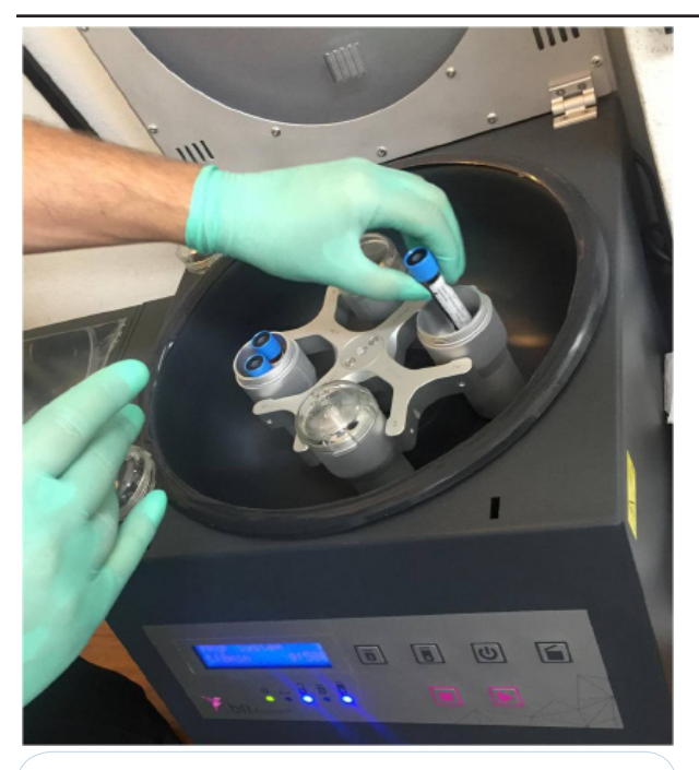
Figure 2: The centrifuging of blood.