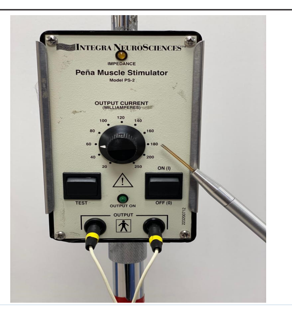
Figure 2: The NMES device used.