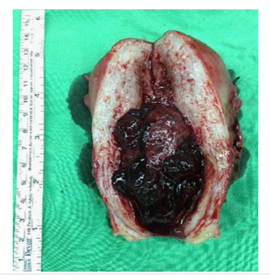
Figure 4: April 8, 2017, Main specimen of total abdominal hysterectomy. The bivalved uterus, from the anterior view, one bulging necrotic mass over the endocervical canal.