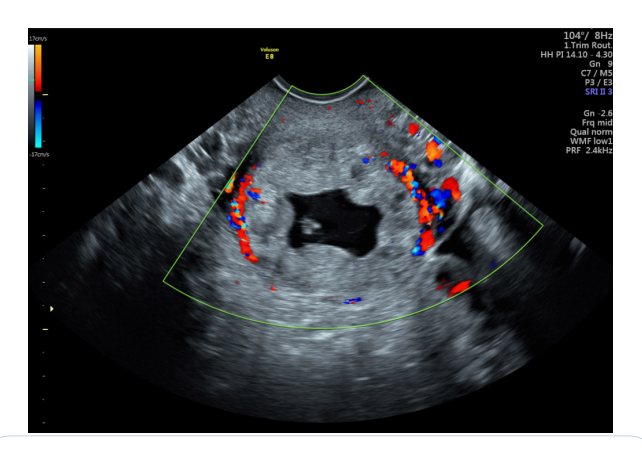
Figure 2: Initial TVUS image: Transverse view: Obvious gestational sac with fetal pole and strong peripheral Doppler signal.