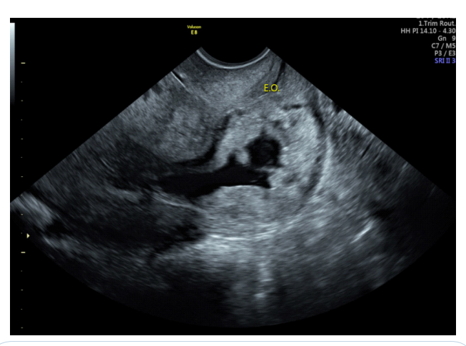
Figure 1: March 04, 2017, Initial TVUS image: Ectopic mass located in the endocervical canal.

The postoperative care of the patient was uneventful, and she was discharged on the 4th day after the surgery. Her \beta -HCG level plummeted to 10.62 mIU/ml on April 21, 2017, 14 days after the hysterectomy (Figure 5).