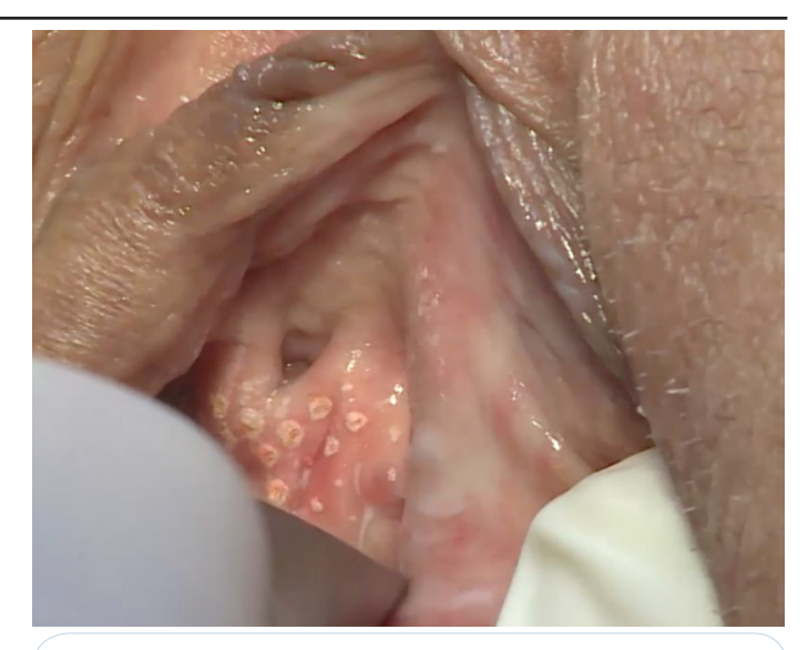
Figure 1: Introitus vaginae with typical pattern of non-ablative laser. The same micro-hyperthermia takes place inside the urethra.

Regarding the probability and severe consequences of a negative outcome of a sling or mesh implantation, plus regarding the unwanted side-effects of the medication scheme at this patient and regarding our long experience with non-ablative, thermal application - we had never strong and very seldom slight signs of unwanted side effects - we offered the patient this way of treatment.