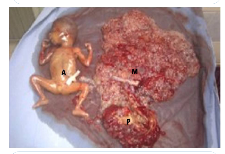
Figure 2a: Morphologically normal fetus (A) and a normal placenta (P) next to a placenta with a molar appearance (M).