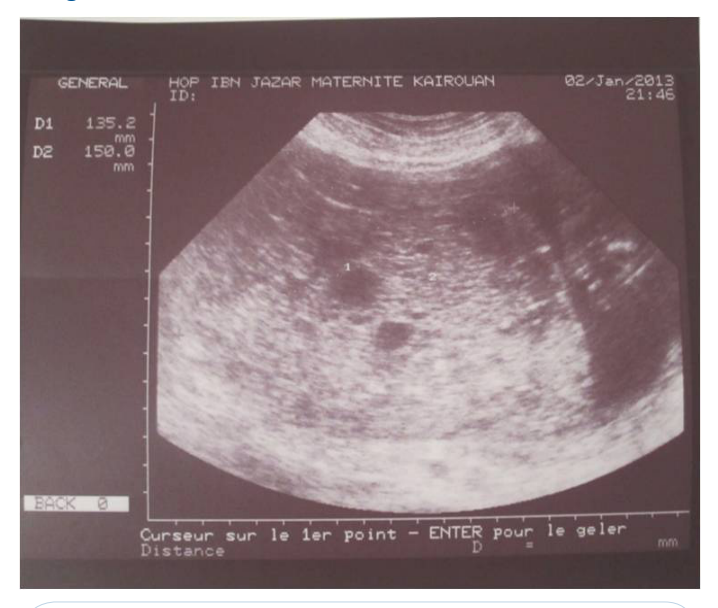
Figure 1: Ultrasound aspect of a hydatidiform mole associated with a normal fetus.