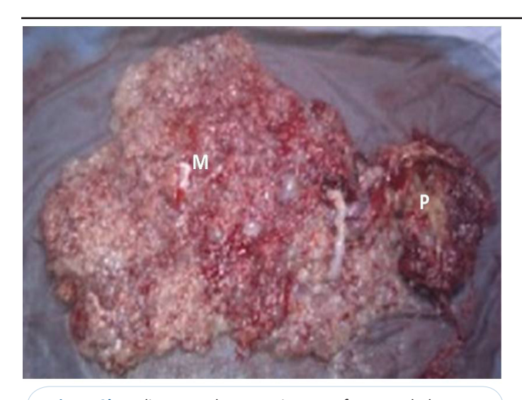
Figure 2b: Delivery product: coexistence of a normal placenta (P) with a large vesicular placenta in molar transformation (M).