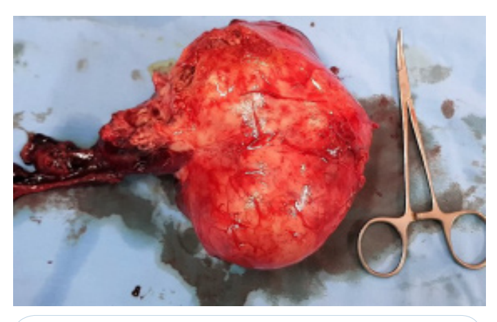
Figure 2: Testicular seminoma with ruptured pedicle