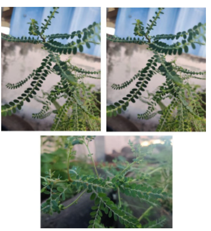
Figure 1: Phyllanthus niruri

importantly in 1986, a study was conducted by Devi et al (1986) [50] in humans on the diuretic, hypotensive and hypoglycemic effects towards P .niruri, which exhibited a significant diuretic effect. Correspondingly, focused analogous studies in man exposed that P. niruri produced decrease in the systolic blood pressure in non-diabetic hypertensive patients and drop of blood glucose in diabetic patients [51,52]. Further an experiment was conducted by JasminBavarva&Narasimhacharya, (2007) [53] to test the antidiabetic ability of P. niruri among normal and diabetic rats and gave a result as the plasma glucose level was significantly reduced in those experimented animals. Likewise, an antidiabetic study was conducted by Okoliet al., (2010) [14] for 28 days in diabetic rats by feeding them the extract of P. niruri which gave a promising reduction in the blood glucose after the end of the experiment. Moreover, administration of water extract of P niruri to rat as animal models results in decreased blood glucose level (P>0.05) along with decreased triglycerides and hence improves insulin secretion [54]. The above mentioned studies clearly indicate the biomedical values of P. niruri against diabetic patients to reduce the glucose levels in the blood of humans.