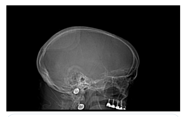
Figure 2: Computerized tomography scan without contrast of the patient's head. Exploration suggested chronic osteomyelitis localized in the frontal bone without affecting the diploe bone.