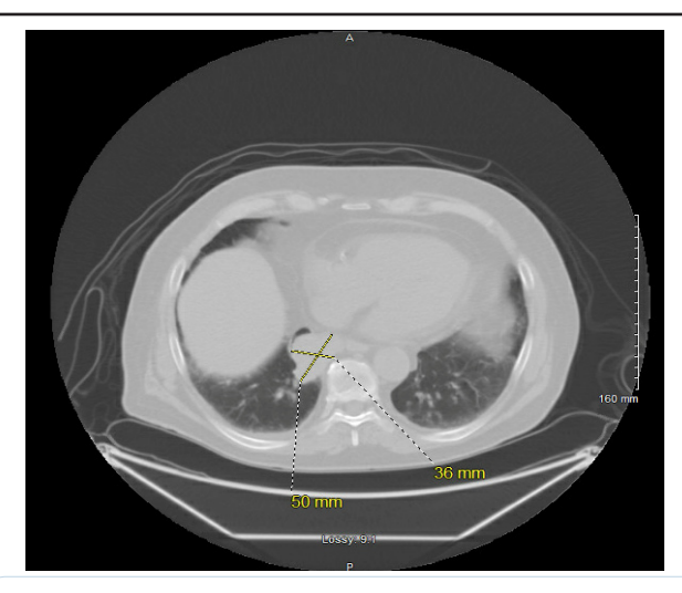
Figure 1: PET CT scan showing pleural-based mass in the right lower lobe at the lung base prior to pembrolizumab treatment.

This case shows the effectiveness of pembrolizumab in treating a rare instance of sarcomatoid lung cancer. More studies are needed to determine the effectiveness of fewer doses of pembrolizumab.