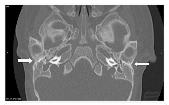
Figure 2: Bilateral atresia of the external auditory canals (white arrows).

Figure 1: Volume reconstruction of a petrous scanner in front view (A) and % oblique (B) showing a bilateral grade III microtia.