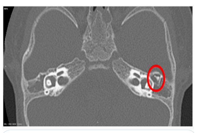
Figure 3: Left intra-tympanic ossicles structures related to a probable incomplete ossicles (red circle).