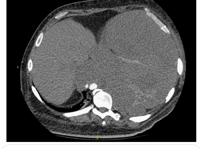
Figure 1 Figure 3