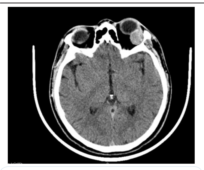
Figure 1: Brain scan in axial section showing the rounded mass at the expense of the lacrimal gland with grade I exophthalmos of the left eyeball.