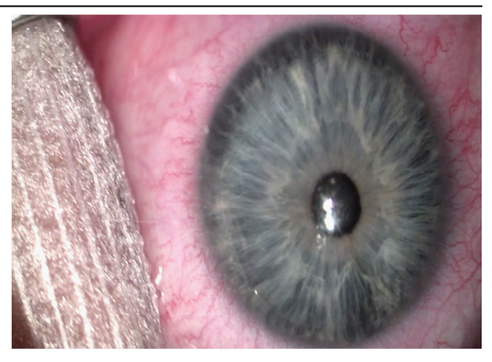
Figure 5: Final aspect

Then we had to dry the edge of the flap and the Figure 5 shows the final aspect before using a soft contact lens for 48 hours to be sure that the flap of the cornea does not move.