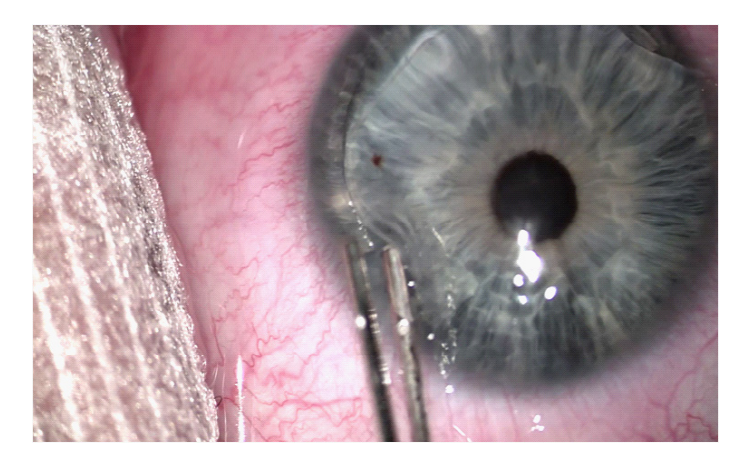
Figure 3: Lifting the flap

Under the microscope, the flap was lifted (Figure 3) and then we tried to "smooth" the flap to make the striae disappear (Figure 4). Even if she came quicky to the clinic, this part of the surgery took more than half an hour.