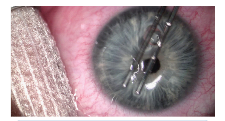
Figure 4: "smoothing" the flap

Then we had to dry the edge of the flap and the Figure 5 shows the final aspect before using a soft contact lens for 48 hours to be sure that the flap of the cornea does not move.