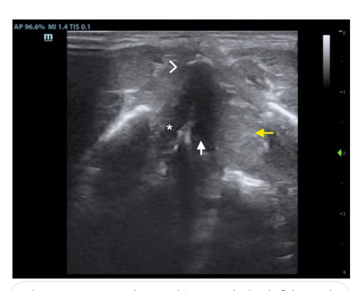
Figure 1: Transverse ultrasound image at the level of the vocal cords demonstrating a normal thyroid cartilage (arrowhead), normal right vocal cord (asterisk) and a soft tissue swelling consistent with hematoma (yellow arrow) lateral to the left vocal cord (white arrow).

A 44-year-old man presented to the emergency department after falling down and hitting his neck directly to the shaft of a tractor. He complained of hoarseness, odynophagia and difficulty breathing. On physical examination, he had normal vital signs. His neck was swollen without crepitus, stridor or pharyngeal erythema. Cervical ultrasonography revealed soft tissue swelling on the left aryepiglottic fold and decreased mobility of the left vocal cord (Figure 1 and video 1). Computed tomography of the neck demonstrated a high-density lesion close to the left side of larynx involving left true vocal cord (Figure 2).