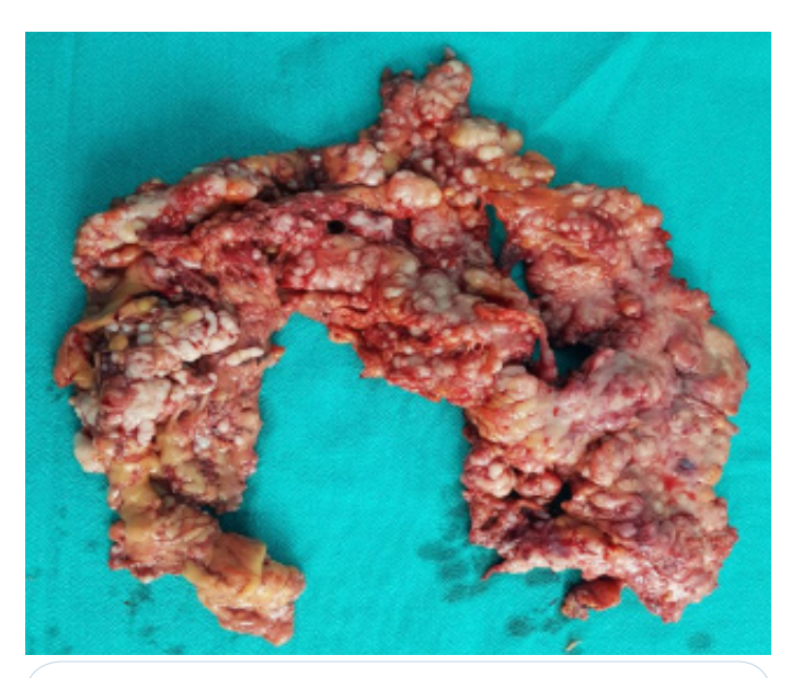
Figure 1: Omental caking in advanced epithelial ovarian cancer – Total omentectomy specimen

Other conditions where "omental caking" is seen are metastatic disease from gastric and colon cancer, lymphoma and Tuberculosis abdomen.