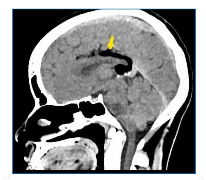
Figure 3: Coronal non-contrast CT scan of the brain revealing well defined hypodense fat attenuating, curvilinear, pericallosal lesion with lobulated surface (yellow arrow). It extends from the level of anterior aspect of body of corpus callosum and posteriorly to wrap-around the splenium of corpus callosum with associated local mass effect. The posterior part of corpus callosum appears hypoplastic.