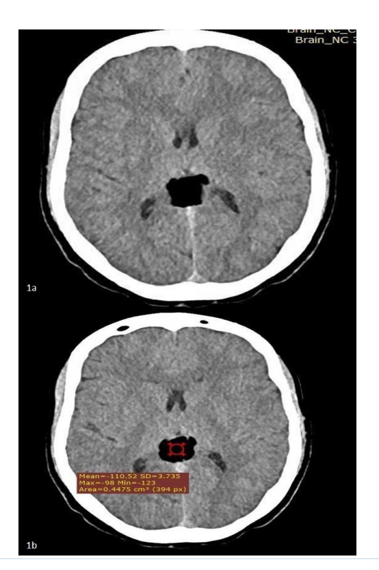
Figure 1: Axial non-contrast CT scan of the brain showing well defined fat attenuating lesion around posterior pericallosal region (Finger 1 and 2). It has lobulated surface.

-There is well defined hypodense fat attenuating, curvilinear, pericallosal lesion with lobulated surface (yellow arrow in figure 5). It extends from the level of anterior aspect of body of corpus callosum and posteriorly to wrap-around the splenium of corpus callosum with associated local mass effect. The posterior part of corpus callosum appears hypoplastic. The lesion has extension into the posterior part of body of left lateral ventricle (red arrow in figure 2).