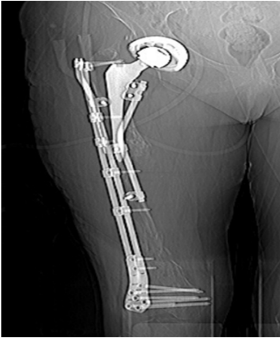
Figure 1: After repair plate screw X-ray.