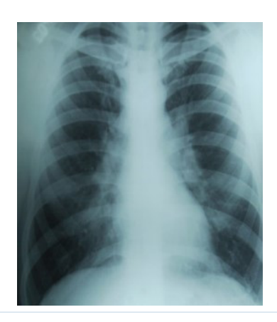
Figure 1: Bilateral hilar fullness on chest x-ray.