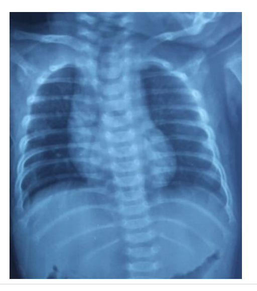
Figure 3: GGO LMZ

In one child moderate involvement of both lungs noted, who is suffering from AML. No severe involvement case found in this study.