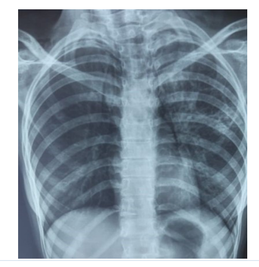
Figure 5: Infiltration LMZ & LLZ thin walled cavity LMZ.