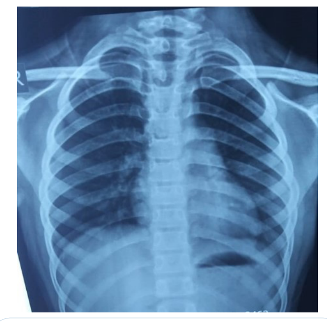
Figure 2: GGO, LMZ& LLZ extending to Periphery.

Figure 1: RLZ- Peripheral Consolidation Rt- Perihilar consolidation. Same patient showing Improvement. Also, LMZ & LLZ peripheral consolidation before improvement