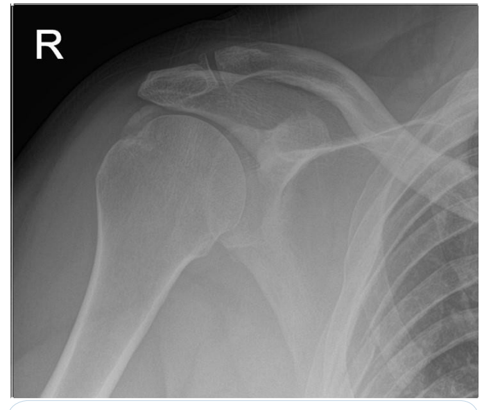
Figure 1: Radiographic imaging of the focal calcification.

performed with a high-frequency linear transducer. Post- procedure radiographs showed that the treated calcium deposit was nearly absent. The patient tolerated the procedure well and was sent home. At follow up in a month's time, patient complained of no pain with near full range of motion of the shoulder joint and absent calcification upon radiographic and sonographic imaging (Figure 6 & Figure 7).