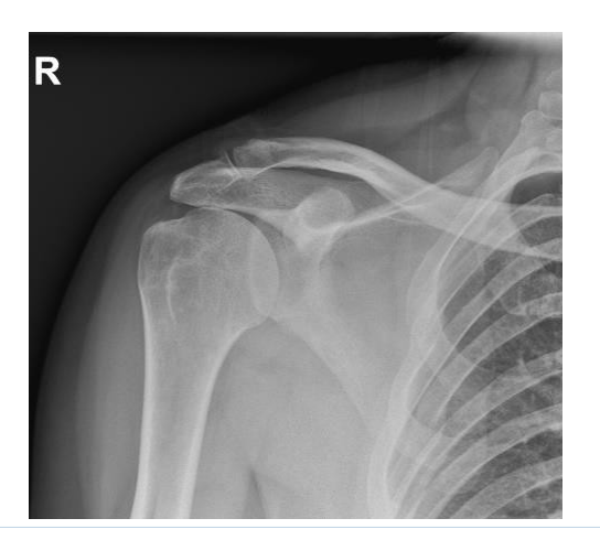
Figure 7: Absence of calcification at follow up radiographic imaging.

Figure 6: Absence of calcification at follow up ultrasound imaging.