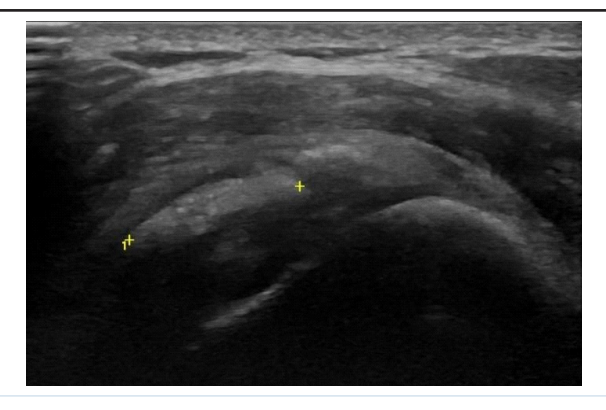
Figure 3: Focal calcification in the sub-acromial sub-deltoid bursa as seen on sonographic imaging.

Sonographic assessment of the different rotator cuff muscles requires knowledge of the muscle origins and insertions and the best positions in which to delineate them sonographically [13]. The subscapularis tendon is best viewed with the patient's arm in neutral position and in external rotation [2,3]. The supraspinatus tendon is hidden from view by the overlying acromion process [2,3]. Therefore it's best viewed with patient's arm extended posteriorly, elbow flexed and the palmar surface of the hand facing anteriorly [2,3]. The infraspinatus and teres minor tendons are best viewed with the hand resting on patient's thigh [2,3]. Visualization of teres minor tendon is confirmation thatthe infraspinatus tendon has been viewed in entirety [2].