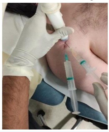
Figure 4: Position for the procedure.

Microcalcifications medial to this bony prominence are not clearly visualised by sonography [12]. The other limitation of sonography is the inability to predict the consistency of calcifications. This poses achallenge while choosing treatment modality for the concerned kind of calcification [12]. For example, viscous calcifications are amenable to ultrasound guided percutaneous