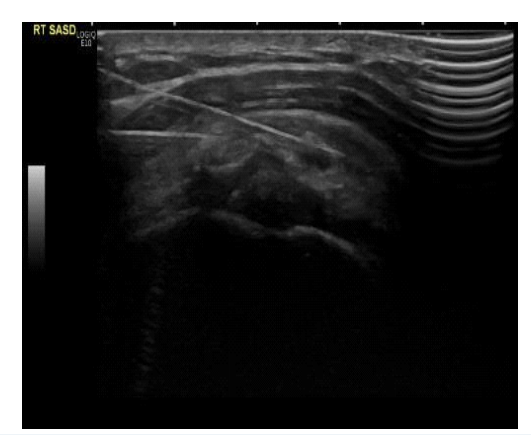
Figure 5: Ultrasound guided percutaneous injection (Barbotage).

Patients who have undergone barbotage report significantly improved 10-year outcomes whencompared to patients treated with alternative methods or not treated at all [5].