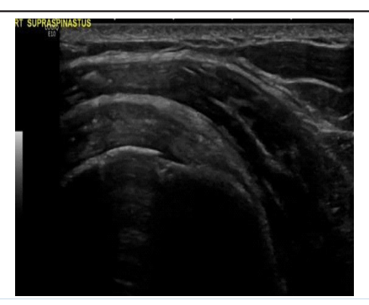
Figure 6: Absence of calcification at follow up ultrasound imaging.