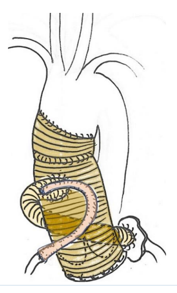
Figure 2: Artist's drawing of the intraoperative situation after completion of all steps. Note the 6 mm graft for the large left coronary ostium coming from the dorsal side and running diagonally cranially to the right anterior side of the main body. Also note the vein graft attached to the tiny right coronary artery after resection of the calcified ostium (see also Figure 1, left upper insert) and connected to LCO graft.