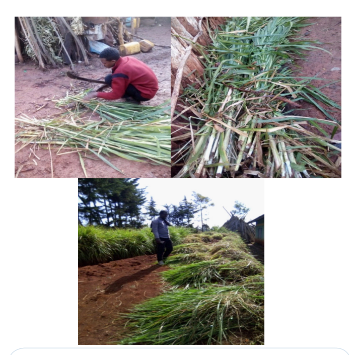
Figure 2: Cut and carrying and chopping of feed practiced by Derashe farmers.

of Wolaita Zone for dairy cattle feeding systems (free grazing, rotational-grazing and zero-grazing). Overall in the study area, there was poor management of grazing-land, only 6.7% of respondent uses manure application, 9.7% practices weeding, and 19.5% did not apply any management activities to grazinglands. The current finding is contradicted to the finding reported by [50] which indicated that (14.8%) households apply fertilizer, (51.8%) households apply cattle manure on grazing-lands, and only 22.5% of the respondents manage their pasture-land, while the majority (77.5%) did not manage their pasture-land in central highlands of Ethiopia.